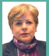
ALICIA BÁRCENA IBARRA

The Internet & Jurisdiction and ECLAC Regional Status Report 2020 seeks to strengthen our understanding of how digital integration is progressing in Latin American and the Caribbean and identifies opportunities we can seize to bring us closer to a more harmonized digital single market.